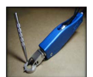
The Gebauer EpiLift uses an applanator bar to help maintain

- Possibility of adjusting flap diameter up to 10mm